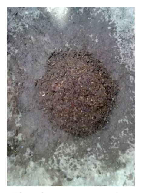
Figure 2: Brown Humus Product