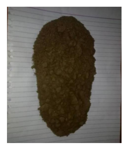
Figure 3: Final Product

During the composting period a 70% reduction in the volume of the waste was observed. This is because the microorganisms decompose the waste into new cells, compost and CO_2 . Therefore, the amount of waste which is converted into new cells and CO_2 does not appear in the final product. As, a significant reduction in the volume is achieved so, this technique can be used for the reduction of waste volumes.